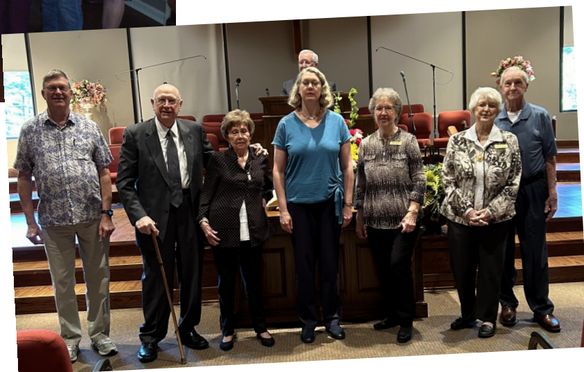
Right: Singing happy birthday at the morning service on Sept 8.